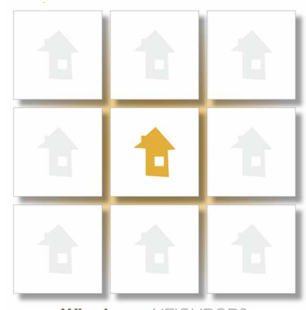
Who is my NEIGHBOR?