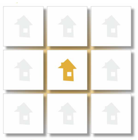
Who is my NEIGHBOR?