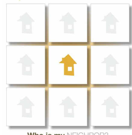
Who is my NEIGHBOR?